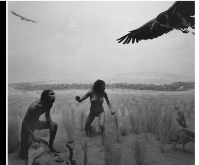
E. Homo erectus