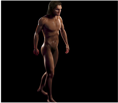
A. Homo sapiens