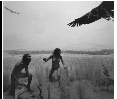
A. Homo sapiens